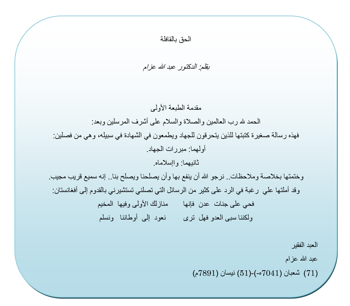
<u>A book of Abdullah Azzam ( the Godfather of Osama Ben Laden)</u> published online by <u>a group of al-Qaeda in Peshawar ( in 2001) for Propaganda and Recruitment.</u>

It is still say that the best publicized use of CYBER-TERRORISM by opposition groups has been propaganda. Many have established Web sites, Email, news services and fax broadcasts. The range of opposition groups using these technologies include groups from Iraq, Saudi Arabia, Northern Ireland, Mexico and the USA. Information techniques now supplement older methods such as radio, leafleting, distribution of audio and video cassettes and even newer ones such as satellite TV.